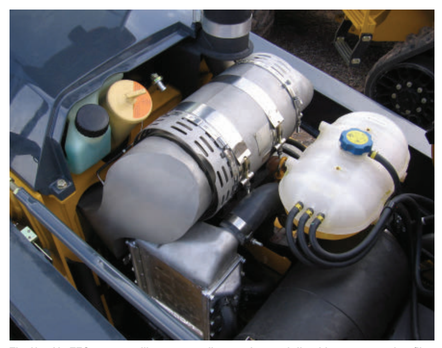
The Nett VorTEQ system utilizes a controller, monitor, and diesel burner to monitor filter condition and control regeneration. It is a stand-alone system and does not interact with the vehicle electronics or operator monitor systems.

green construction sites — especially in the Northeast and California that require retrofitting of older engines with verified Level 3 DPFs," Chrusciel said.